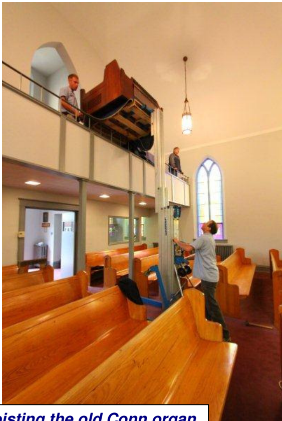
Hoisting the old Conn organ down out of the balcony!